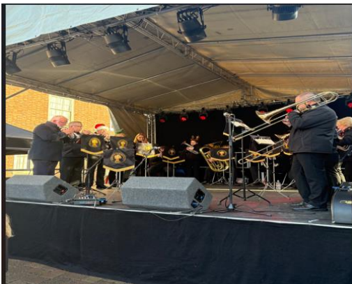
Christmas Festival 2024 – Performing on the Stage

Publication of 'The Bartonian', provision of the Christmas Event, Town Centre Christmas decorative lighting, the Christmas tree, Picnic in the Park event and Grant Donations to local organisations. The Committee has also successfully taken over management of the new monthly market. Financial support to Barton Bike Night, Barton Carnival, Barton Lions Firework Display, Barton Tourism Group, the Rural Car Scheme, Public Convenience opening and maintenance of the Town Clock. Also the Town Award Event.