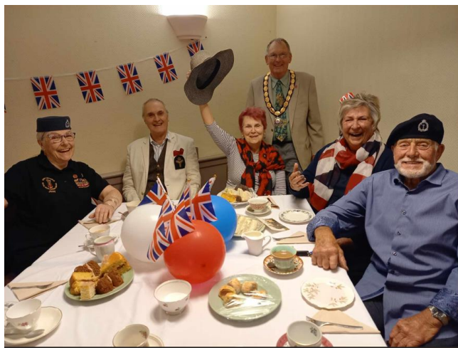
D-Day Afternoon Tea